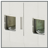
terminal capacity: max. 35 mm²