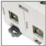
capability to mount using comb busbars